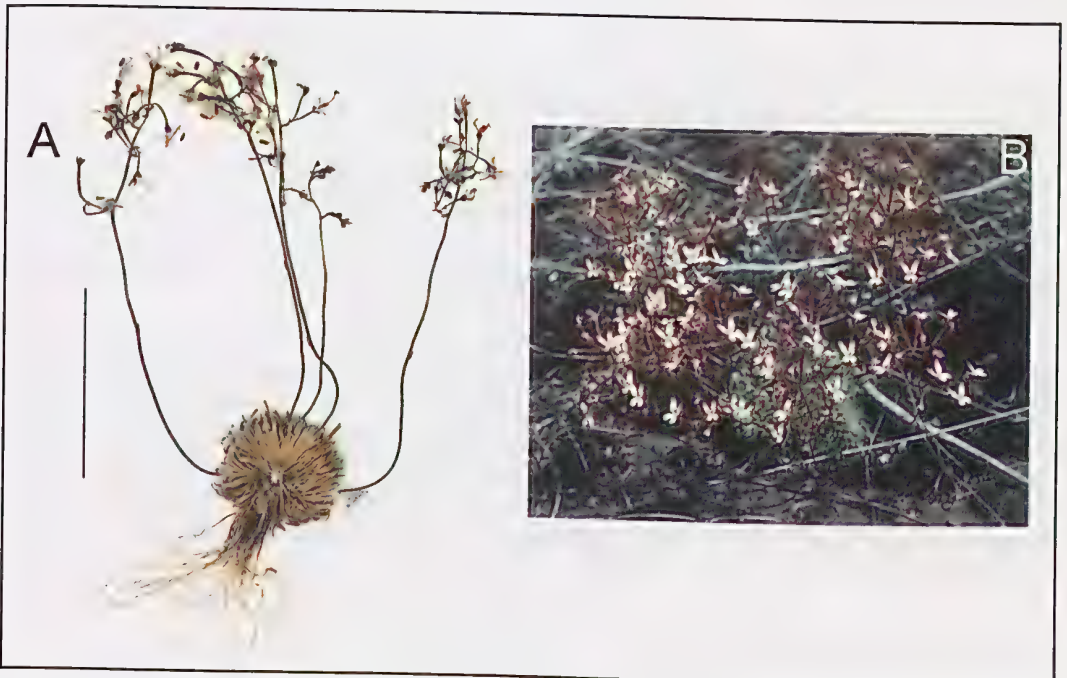
Figure 2. Stylidium ferricola (G.J. Keighery 12932). A – an individual from the holotype (PERTH 05472148), scale bar at 5 cm; B – habit, photograph by Greg Keighery.